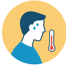
FEVER 100.4* *or school board policy if threshold is lower