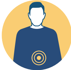
NAUSEA OR VOMITING