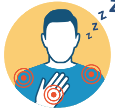
MUSCLE PAIN AND FATIGUE